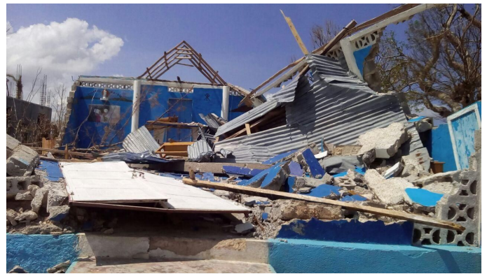
One of many churches destroyed by Hurricane Matthew in Haiti. Thousands have been left homeless and without medical care. Churches remain one of the best ways to help people most affected by the storm.

In October Haiti was hit hard by Hurricane Matthew, the fiercest Caribbean storm in nearly a decade. Homes, Schools, Hospitals, and whole villages were washed away or flattened by flooding and the 200+ mph winds. The death toll has risen to more than 1,000 people. Now a month later, one of Matthew's worst repercussions has been a crippling outbreak of cholera throughout much of the devastation zone.